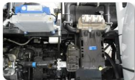
System of high pressure pump