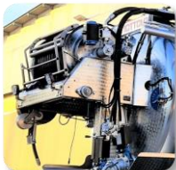
Rear fixed hose reel