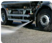
Lateral washing nozzle