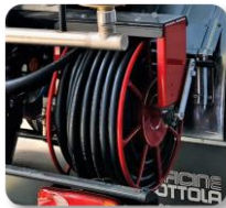
Manual hose reel