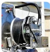
Rear hydraulic hose reel